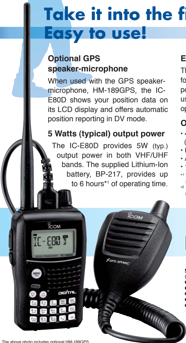
The above photo includes optional HM-189GPS.